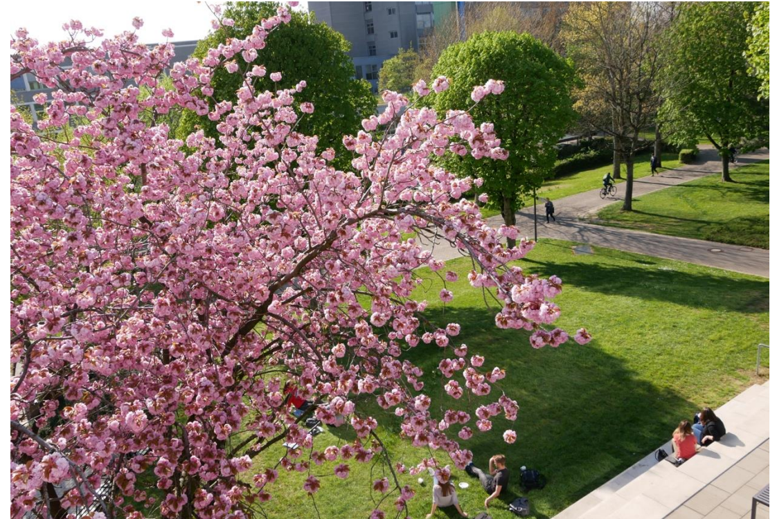
Uni Paderborn in spring