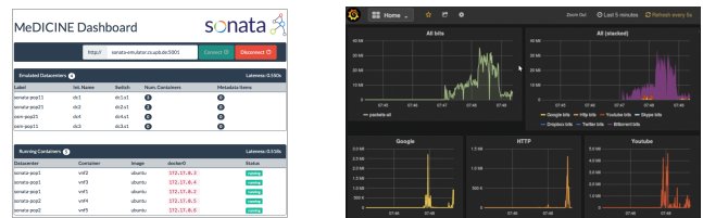
Fig. 3: Demonstration dashboards showing VNF instances running inside the emulated PoPs and the corresponding monitoring information, like CPU, memory and network performance.

The demo can be executed either locally on a single laptop running the entire emulation platform or remotely on a server. It requires a power outlet for a laptop and one or two large screens to show the dashboards and monitoring data. A wall or stand to mount a poster will help to describe the demo to